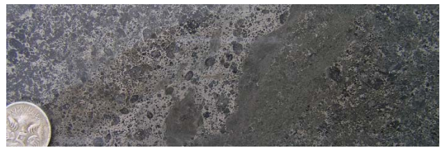
Figure 3: Margin of pyrrhotite-rich breccia at 404.25m in hole MN14D37.

Drill hole MN14D37 intersected metasedimentary gneisses containing several zones of massive pyrrhotite breccia along with alteration zones of disseminated pyrrhotite, amphibole and garnet, especially within the interval 402-428m.