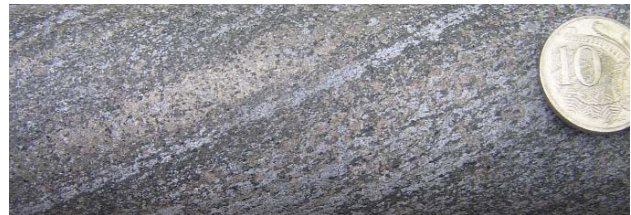
Figure 4: Disseminated pyrrhotite and chalcopyrite alteration within garnetiferous gneiss at 422.8m in hole MN14D37 and part of 1m interval assaying 2.41% Zn and 0.02% Cu.

This zone is anomalous in copper and gold, and locally zinc, returning a 21m interval @ 0.56% Zn, 0.28% Cu and 0.06g/t Au (403-424m, downhole intercept) (Tables 2-3). Within this 21m interval is a 6m subzone @ 1.36% Zn (418-424m, downhole intercept). Maximum individual 1m assay results are 2.29% Zn (403-404m) and 2.41% Zn (422-423m) (downhole intercepts). Anomalous copper and gold occur throughout the interval, with maximum values for individual 1m samples of 0.84% Cu and 0.14g/t Au (405-406m, downhole intercept), indicating consistent, but low grade values (Table 3).